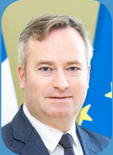
Mr Jean-Baptiste Lemoyne

Tags: @JBLemoyne @Europe2022FR #EU2022FR #PFUE2022